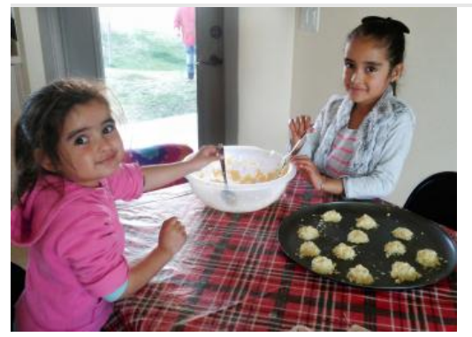
<u>(/story/food-hero-</u> <u>enables-oregonians-eat-</u> <u>healthier)</u>