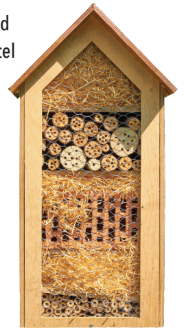
Backyard Bee Hotel

Managed leafcutter bees and mason bees nest in small tubes or in blocks with many holes in them. Hundreds of blocks or tubes are often stored next to each other in a bee shelter that protects the nests from rain and wind.