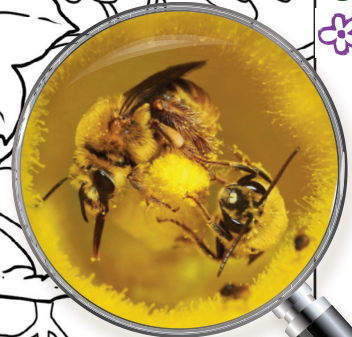
Squash bees on the anther of a pumpkin flower.

Color this page online at: https://placeholder link