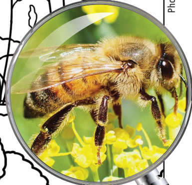
A honey bee gathering nectar

The average honey-bee hive contains around 25,000 bees.