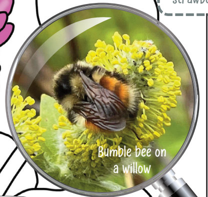
Bumble bee on a willow

Color this page online at: https://beav.es/c8p