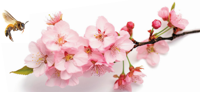
A honey bee on a cherry blossom just like in the drawing below!