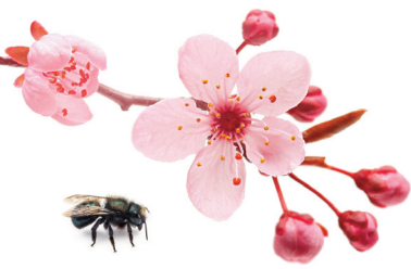
Mason Bee and Cherry Flowers