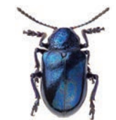
Cobalt Milkweed Beetle

Bees are champion pollinators in habitats across Oregon. A team of pollinators work with bees in Oregon to make food. Insect and animal pollinators include ants, beetles, birds, butterflies, flies, moths and wasps! They may move pollen in different ways, but together they help plants make more plants and help make our food!