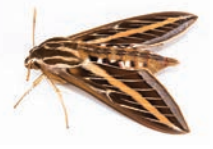
White-Lined Sphinx Moth