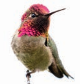
Male Anna's Hummingbird