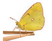
Clouded Sulphur Butterfly

Why are animals and dairy on the map? Bees are important pollinators of alfalfa and clover flowers. Farmers grow these plants to feed many different types of animals that give us milk, cheese, meat, eggs and more!