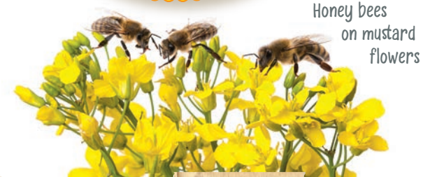
Honey bees on mustard flowers

Use the map legend to find a favorite Oregon-grown food and where bees help pollinate it!