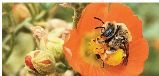
Diadasia (mallow bee) on mallow flower. Many plants and bees need each other to survive; they are interdependent.

In cooking and nutrition, some fruits are called vegetables. That's true for tomatoes, green beans, peppers and squash. This is because their taste and the nutrients they provide are more like vegetables than fruits. For example, green beans—also called string beans—are green, fleshy pods that grow around the seeds of a bean plant. People think of them as a vegetable, but plant experts think of them as a fruit.