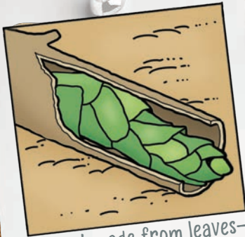
A nest made from leaves— leafcutter bees