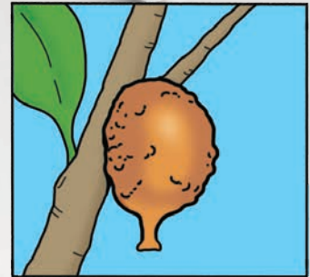
A nest made of resin— resin bees