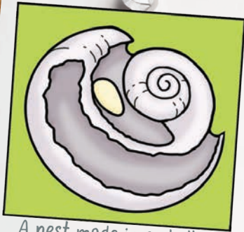
A nest made in a shell— mason bee