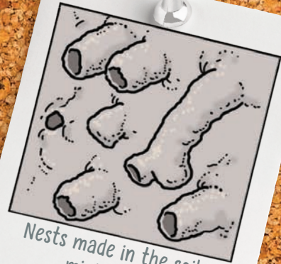
Nests made in the soil— mining bees