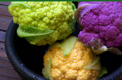
4—White, Purple, Yellow & Green

Take a guess! How many different colors can cauliflower be?