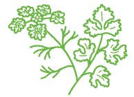
Green Metallic Sweat Bee