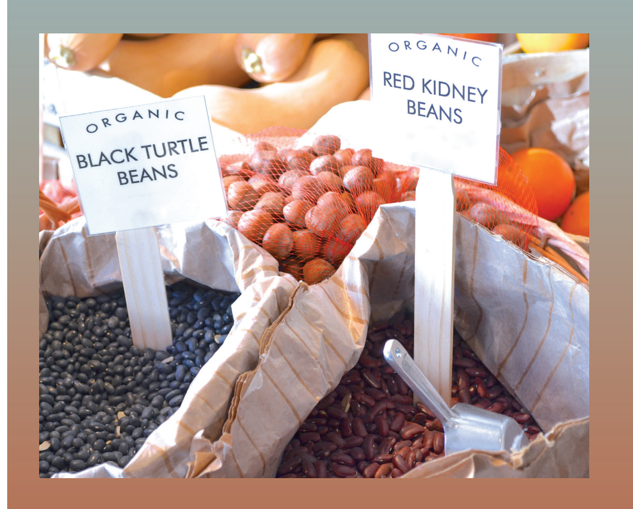
Beans are actually large seeds!