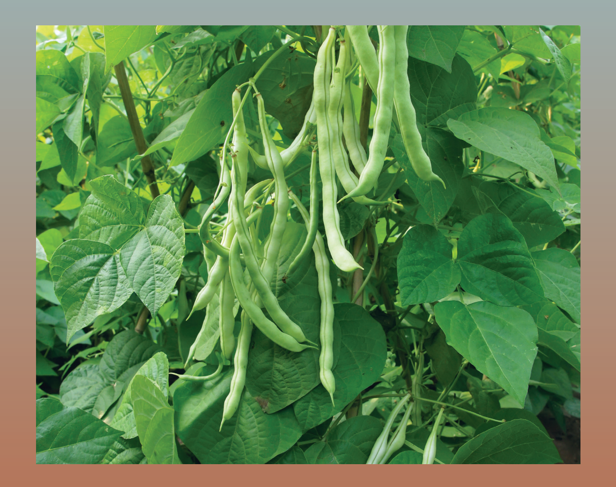
The United States produces more dry beans than any other country, growing up to 1.7 million acres.

Beans improve the land they are grown in by adding nitrogen to the soil! This is why they are called "nitrogen fixers."