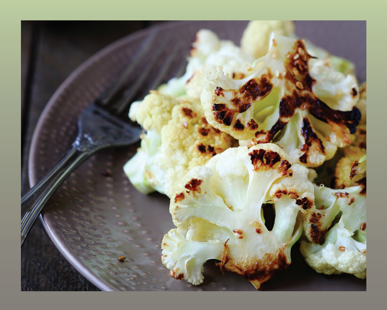
The stem and leaves of the cauliflower plant have a strong flavor, but they can be used to make tasty vegetable broth!