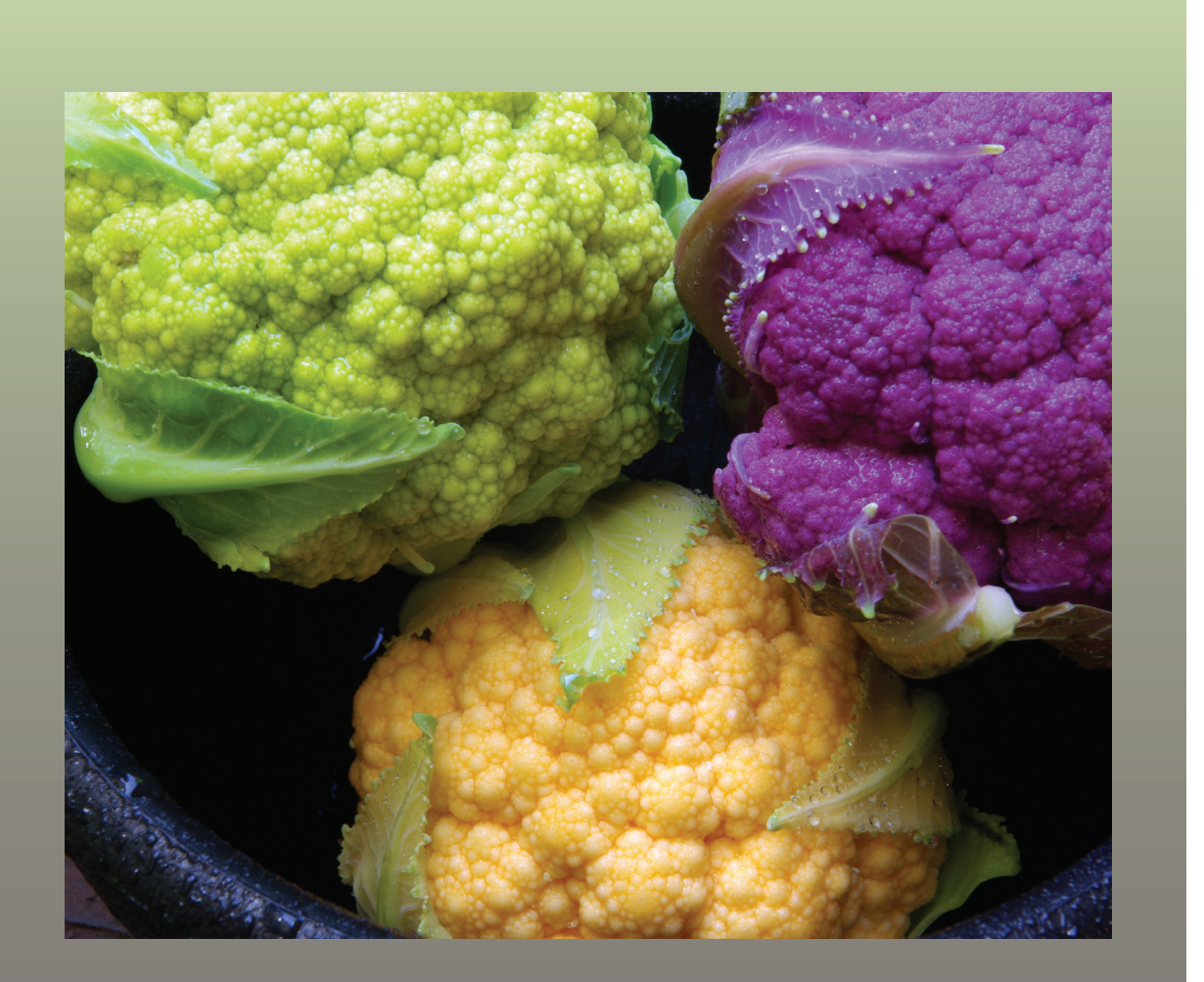
Although the most commonly used cauliflower in America is the large white type, there are also green, yellow, and even purple varieties!